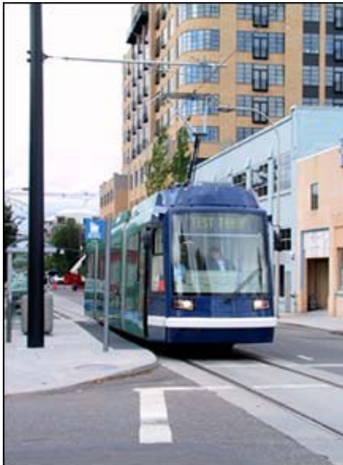
European-style low-floor LRV designed exclusively for urban transit is car of choice for new Portland Streetcar system. Longer, higher-capacity version of this 140-passenger, double articulated vehicle might be ideal for Liberty Loop.

On the Back: Letter from the Editor, Astor Place Festival